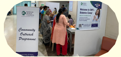
Free Diabetic Screening camp