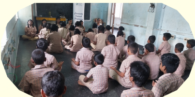
Yoga session @ SAP School