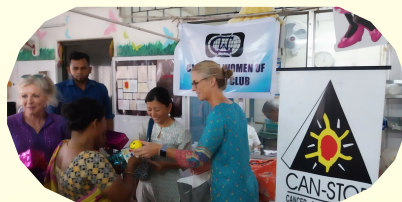
Diwali celebration @ ICH