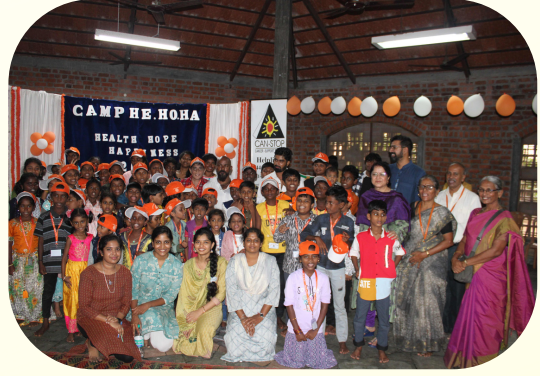
CAMP HE HO HA 2023 @ Dakshinachitra