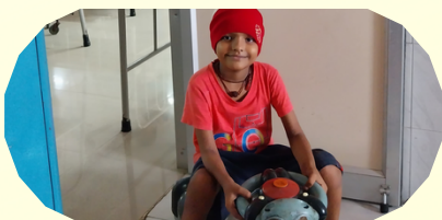
Art & Play therapy